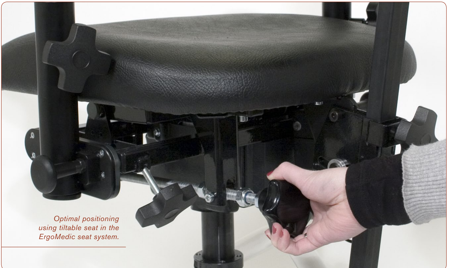
Optimal positioning using tiltable seat in the ErgoMedic seat system.

The adjustable seat angle, forwards and backwards, makes it easy to find the correct position for the patient.