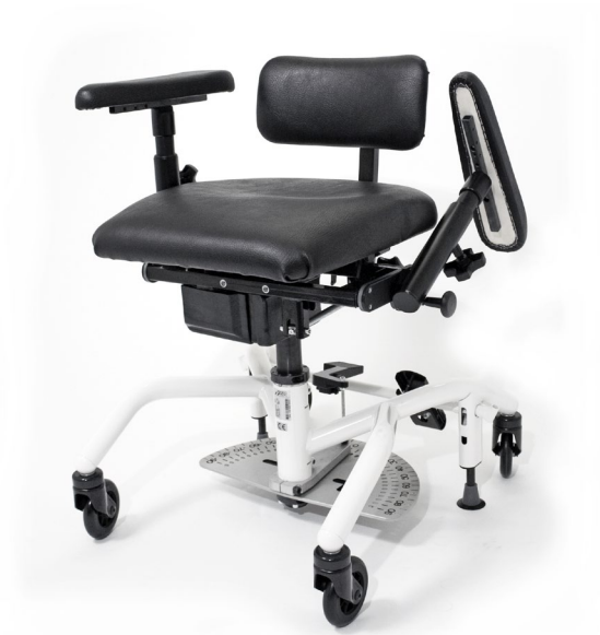
Low backrest 33x16 cm (standard).