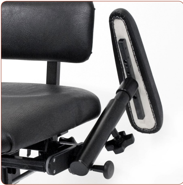
Foldable armrest for easier lateral movements.