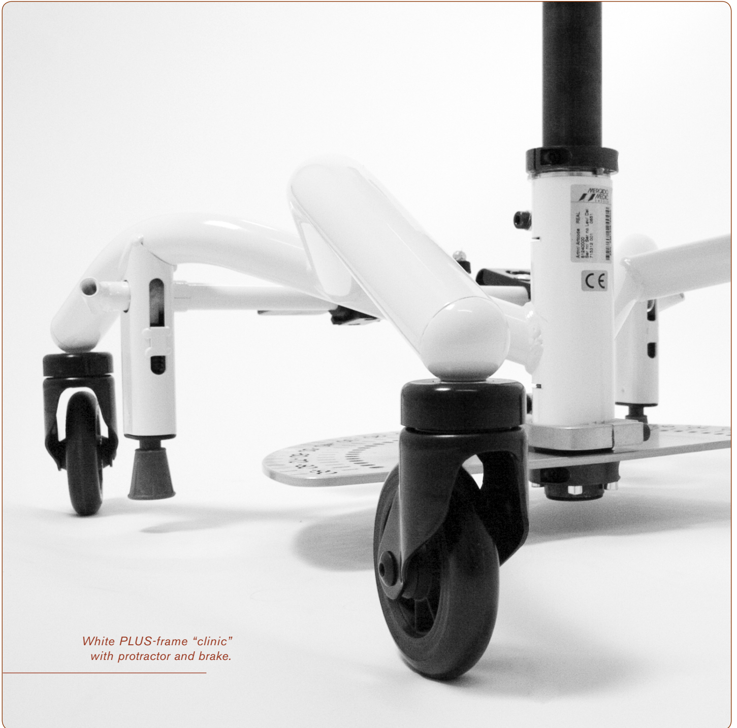
White PLUS-frame "clinic" with protractor and brake.