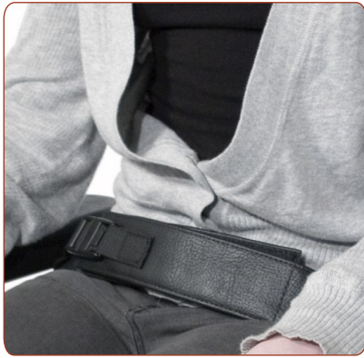
Positioning / hip belt.