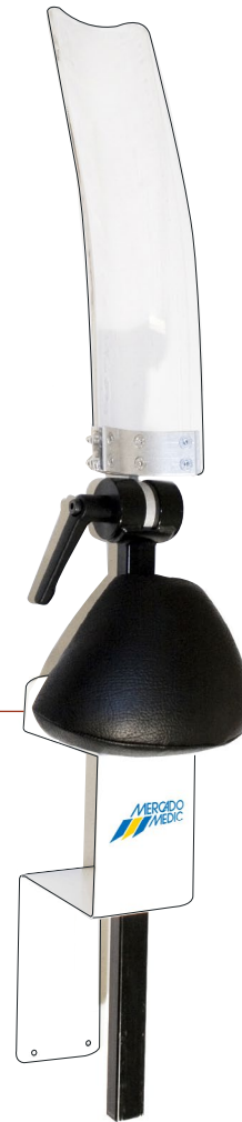
Wall mounts for backrests that is not mounted on the chair.