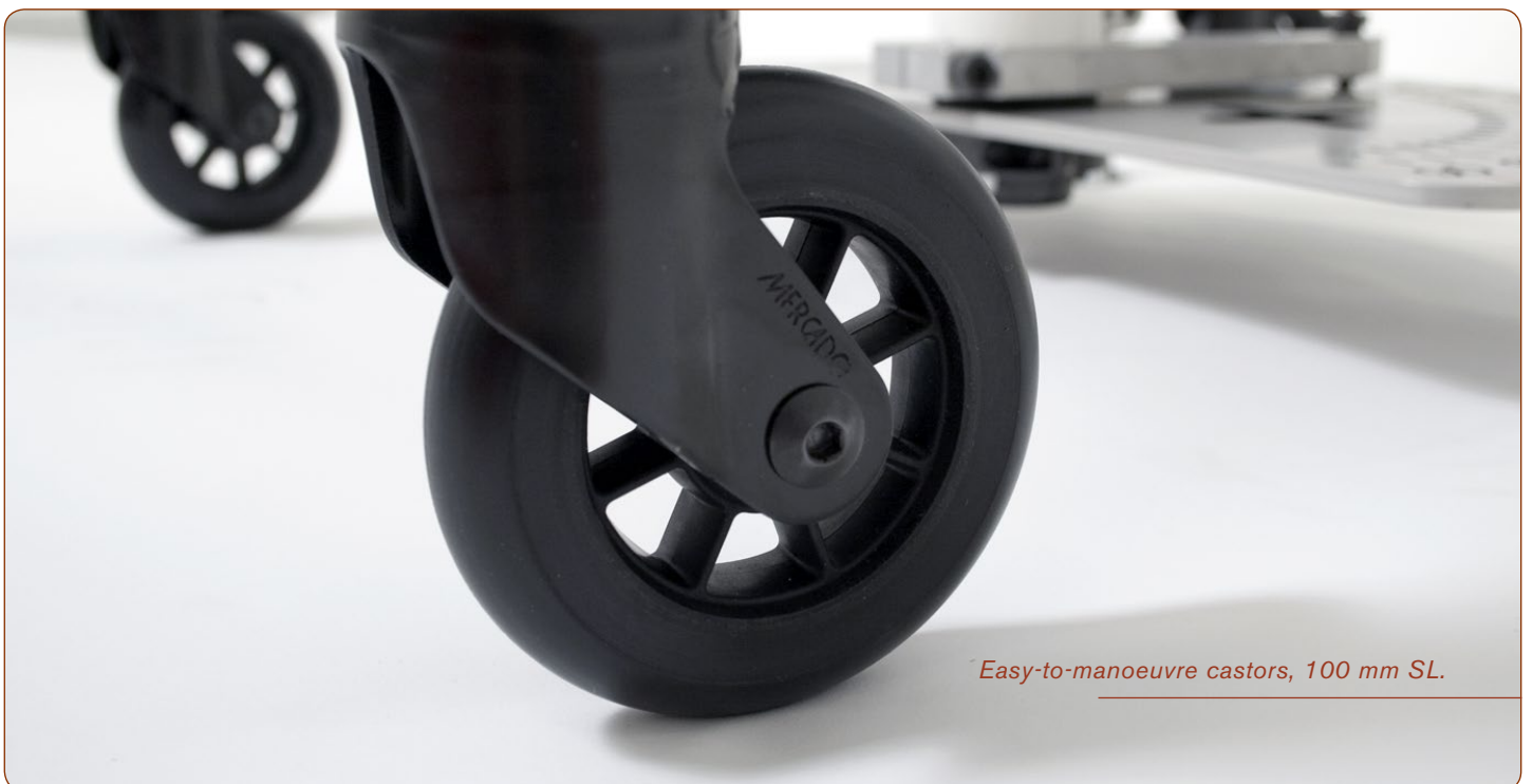
Easy-to-manoevre castors, 100 mm SL.