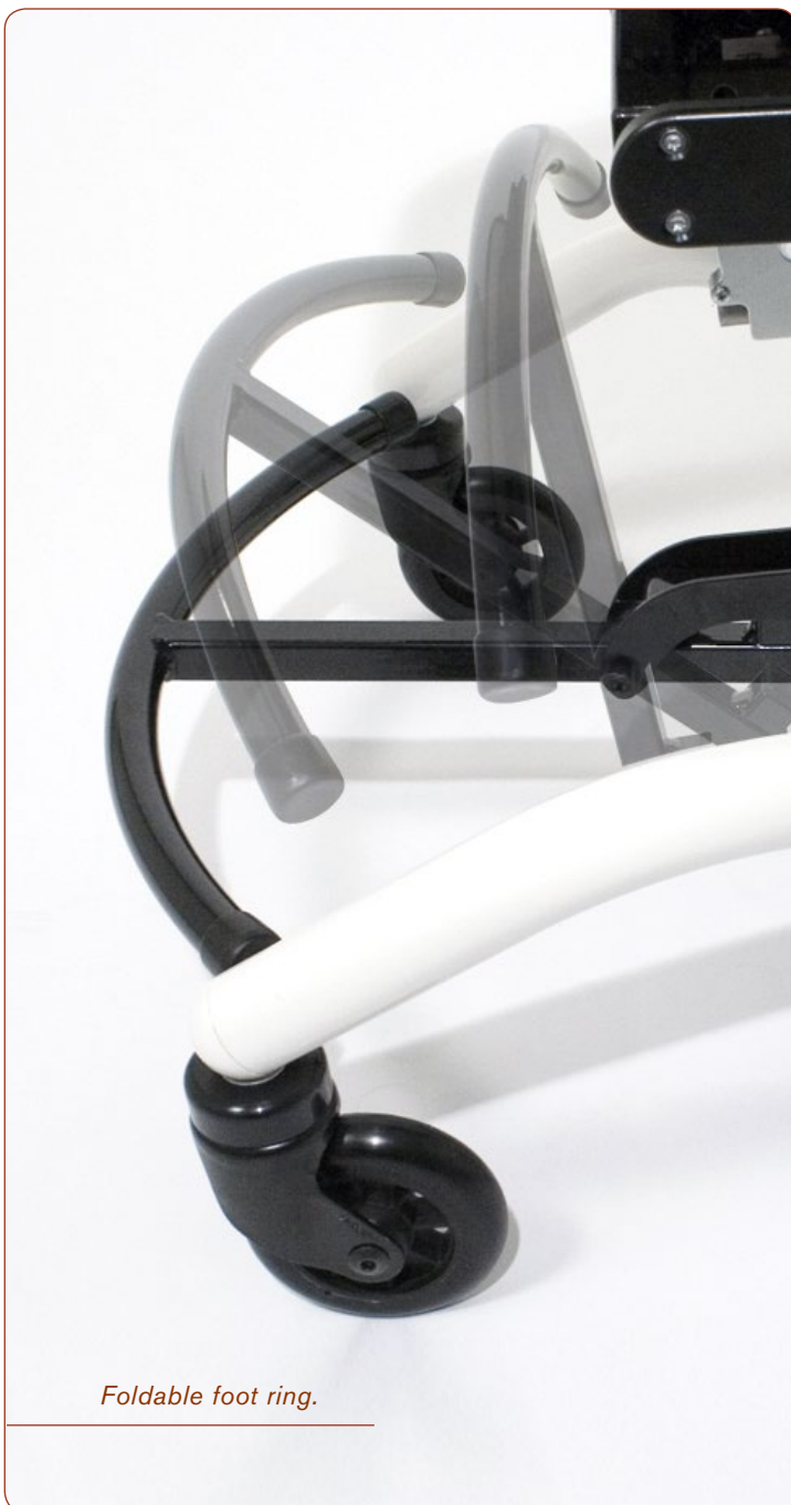
Foldable foot ring.

As accessories, we have wall mounts for the backrests that is not mounted on the chair.