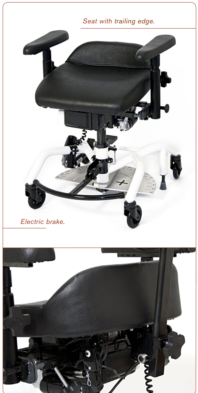
Seat with trailing edge.