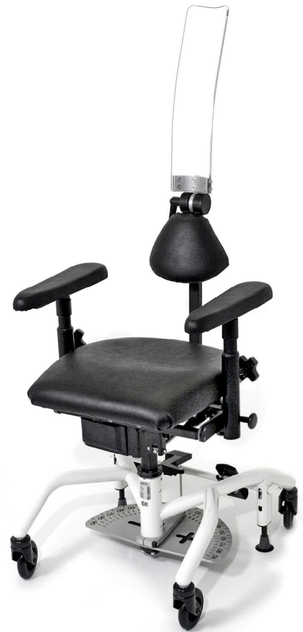
Backrest with neck support in Makrolon (standard).