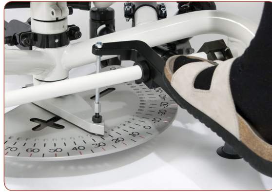
Protractor and brake are controlled by foot.